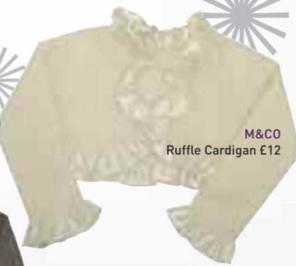
M&CO Ruffle Cardigan £12