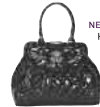
NEW LOOK Handbag £25