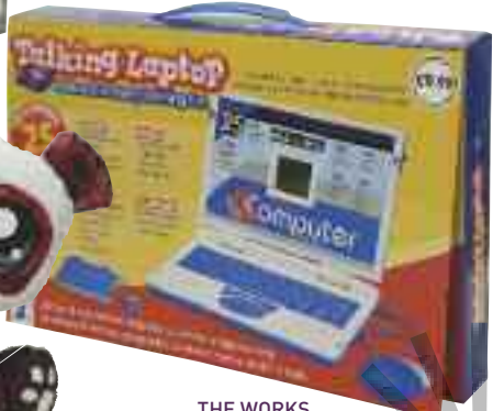
THE WORKS Talking Laptop £9.99