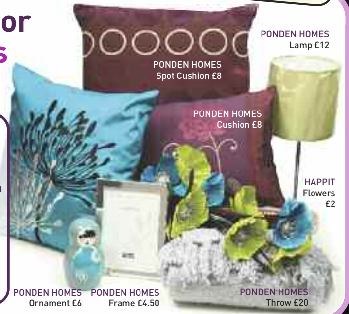
PONDEN HOMES Satin Cushion £12

Bring a little sparkle to your home this Season with the Piazza – with Ponden Home Interiors, Happit, Homezone Extra and Brighthouse all offering stylish furnishings and accessories to brighten up your home now that the dark nights are upon us!