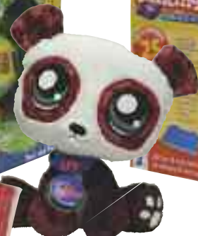
SEMICHEM Night Garden Spinning Top £9.99 Little Pet Shop VIP £4.99 Pyjamas £3.99