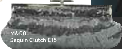
M&CO Sequin Clutch £15