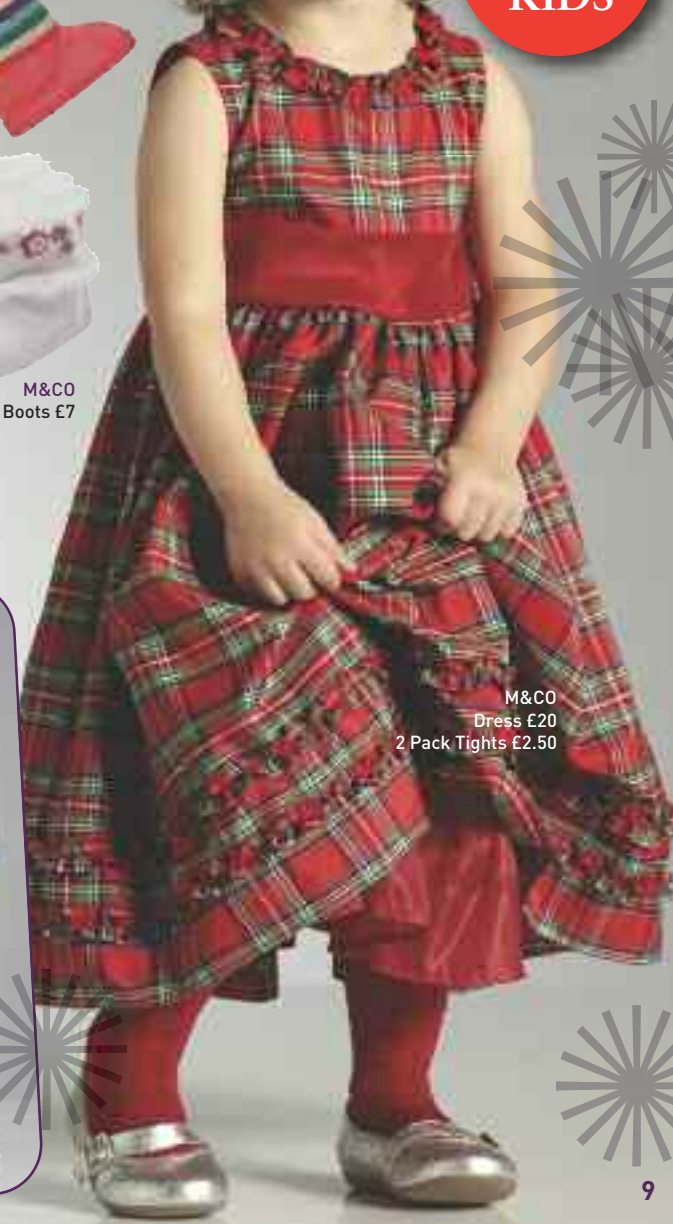
M&CO Dress £20 2 Pack Tights £2.50