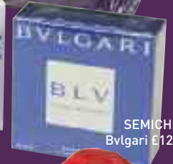
SEMICHEM Bvlgari £12.99