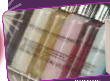
BODYCARE Baylis and Harding Set £4.99