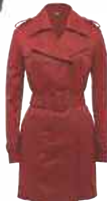
M&CO Trenchcoat £45