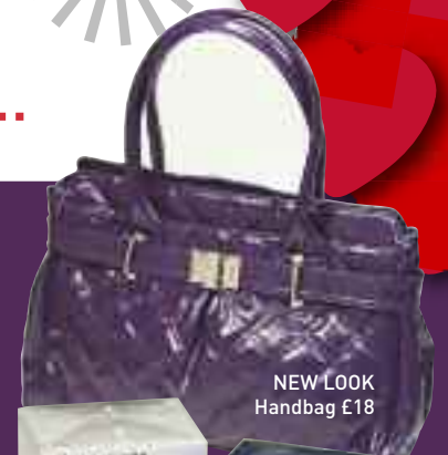
NEW LOOK Handbag £18

Share the love this Season with a little help from The Piazza! You'll find everything you need to make this Christmas one to remember for the whole family – whether you're looking for great gifts, fantastic fashions or delicious Christmas dinner options, Piazza stores have got it covered.