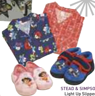
STEAD & SIMPSON Light Up Slippers £7.99