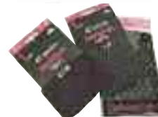
ETHEL AUSTIN Fashion Tights from £2.50