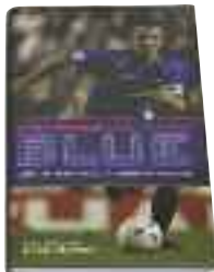
THE WORKS Barry Ferguson £9.99 Zen of Naka £9.99