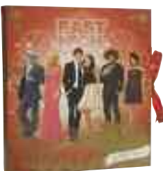
SEMICHEM HSM Gift set £4.99 Ben10 Game £9.99

SIT IN TEA OR COFFEE + CUP CAKE OR STRAWBERRY TART ONLY £2.49 Valid until 01/01/10. Management Rights Reserved.