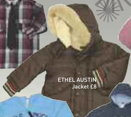
ETHEL AUSTIN Jacket £8