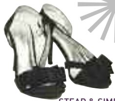
STEAD & SIMPSON Sandals £19.99