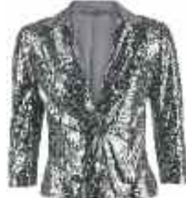
PEACOCKS Sequin Blazer £45