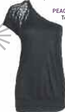
PEACOCKS Top £16