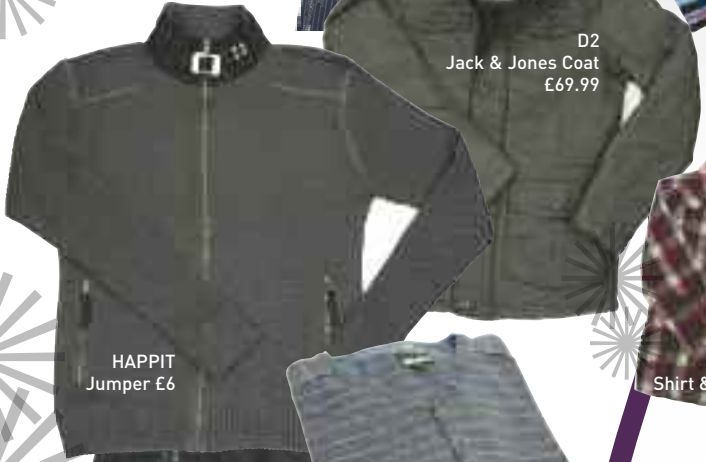
D2 Jack & Jones Coat £69.99