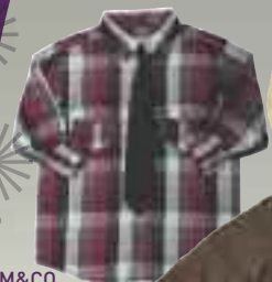
M&CO Shirt & Tie £12