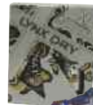
ETHEL AUSTIN Pyjamas £4