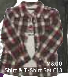
M&CO Shirt & T-Shirt Set £13