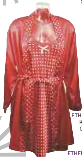
ETHEL AUSTIN Kimono £10 Chemise £6