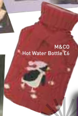
M&CO Hot Water Bottle £6