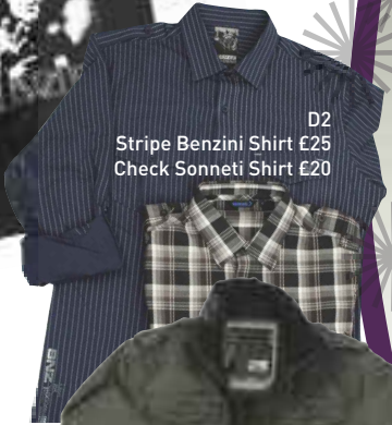
D2 Stripe Benzini Shirt £25 Check Sonneti Shirt £20