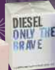
SEMICHEM Diesel £26.99