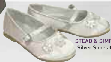
STEAD & SIMPSON Silver Shoes £9.99