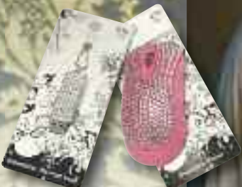
NEW LOOK Bling USB & Mouse £10 each