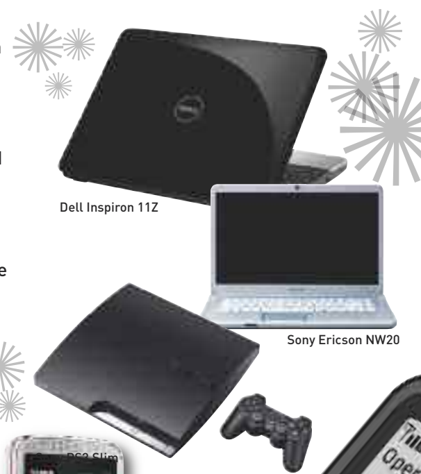
Dell Inspiron 11Z