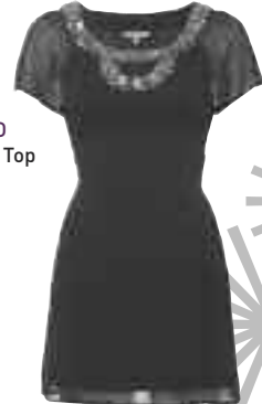
PEACOCKS Knit Dress £14