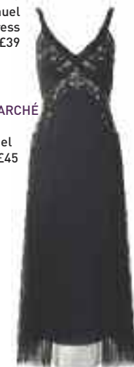
BONMARCHÉ David Emanuel Dress £45