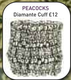
PEACOCKS Diamante Cuff £12