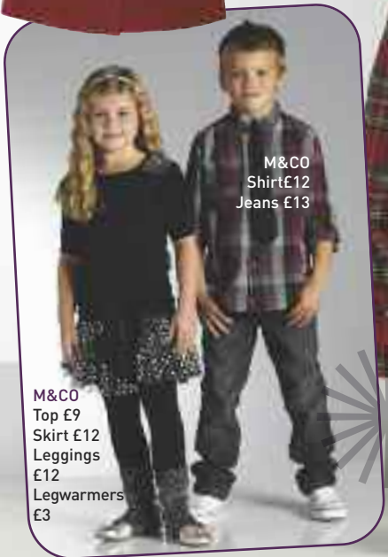
M&CO Top £9 Skirt £12 Leggings £12 Legwarmers £3