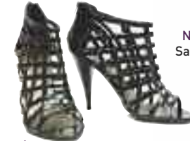
NEW LOOK Sandals £15