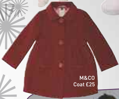
M&CO Coat £25