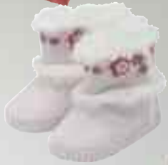
M&CO Boots £7