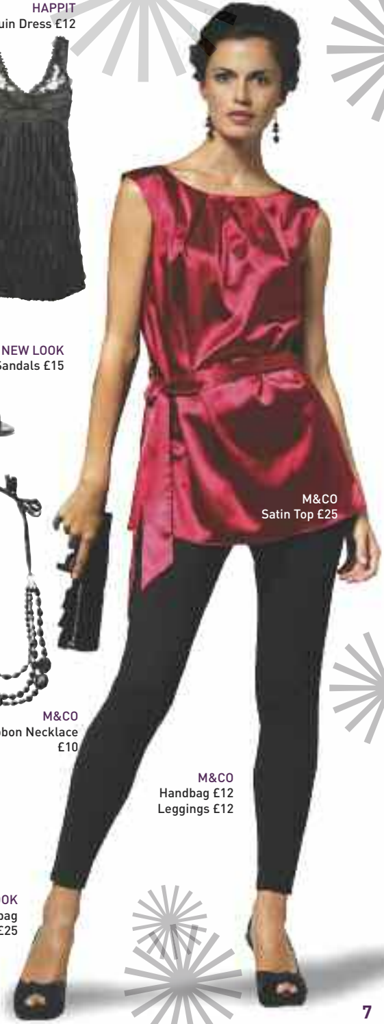
M&CO Satin Top £25