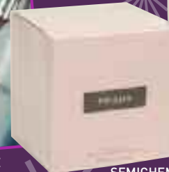
SEMICHEM Prada £39.99