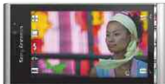
Sony Ericsson Satio