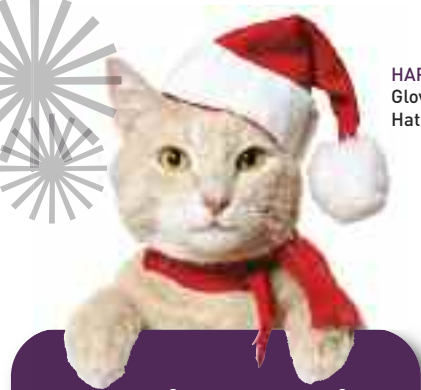
HAPPIT Gloves £5 Hat £3