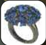
PEACOCKS Rings from £3.50