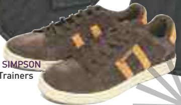
STEAD & SIMPSON Beckett Trainers £19.99