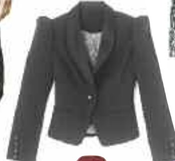
NEW LOOK Blazer £60