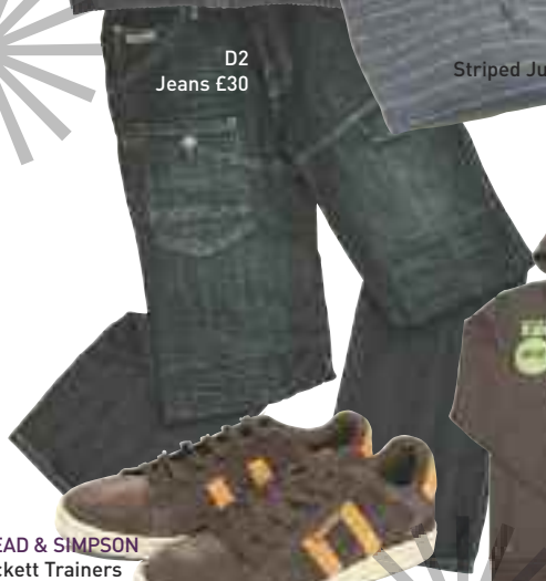
D2 Jeans £30