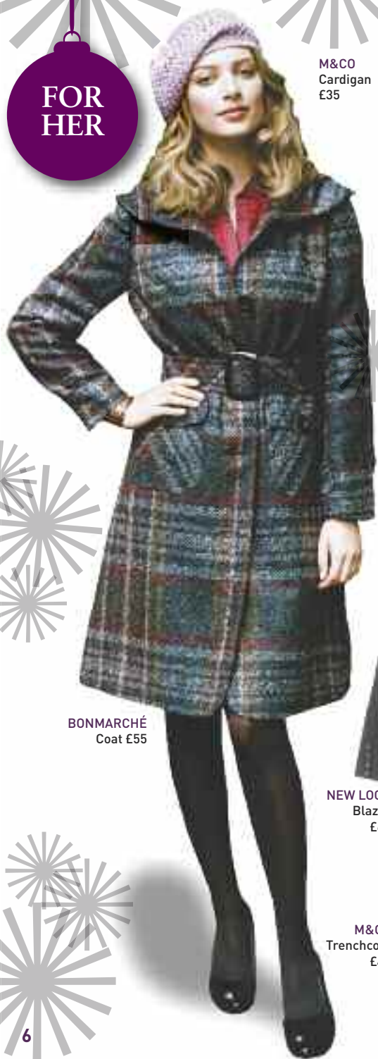
M&CO Cardigan £35