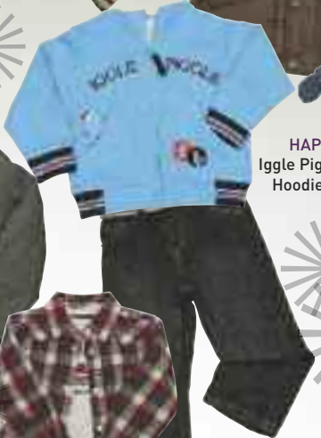
HAPPIT Iggie Piggie Hoodie £7