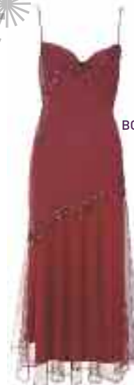
BONMARCHÉ David Emanuel Dress £39