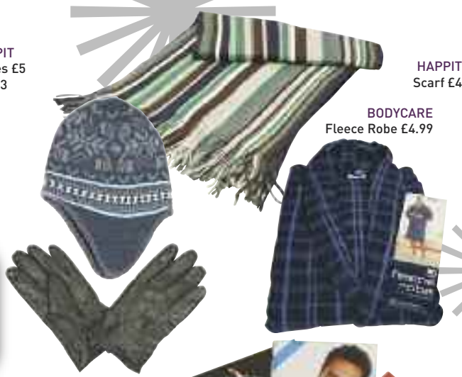
HAPPIT Scarf £4