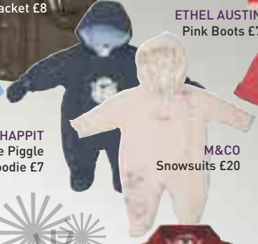
M&CO Snowsuits £20