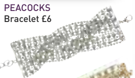
PEACOCKS Bracelet £6