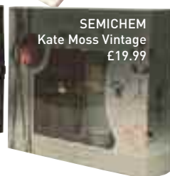
SEMICHEM Kate Moss Vintage £19.99