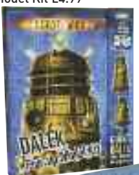
THE WORKS Model Kit £4.99