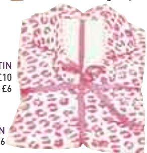
ETHEL AUSTIN Pyjama Set £6