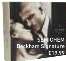
SEMICHEM Beckham Signature £19.99