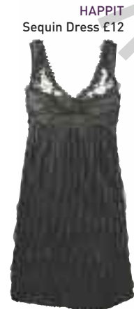
HAPPIT Sequin Dress £12