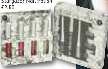
NEW LOOK Lip Gloss Set £4 Eyeshadow Set £5