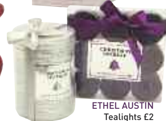
ETHEL AUSTIN Tealights £2 Candle £3

Take a break from your Shopping with these great vouchers from Aulds: