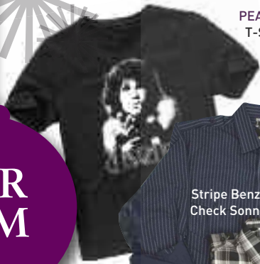
PEACOCKS T-Shirt £8