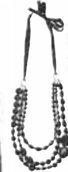
M&CO Ribbon Necklace £10