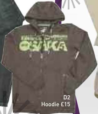
D2 Hoodie £15