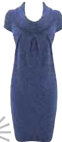
M&CO Dress £40