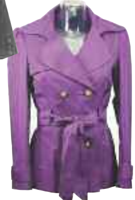
ETHEL AUSTIN Coat £25