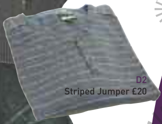
D2 Striped Jumper £20