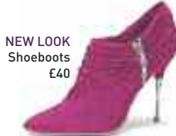
NEW LOOK Shoeboots £40