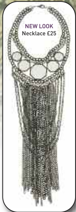
NEW LOOK Necklace £25