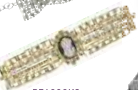
PEACOCKS Necklace £8