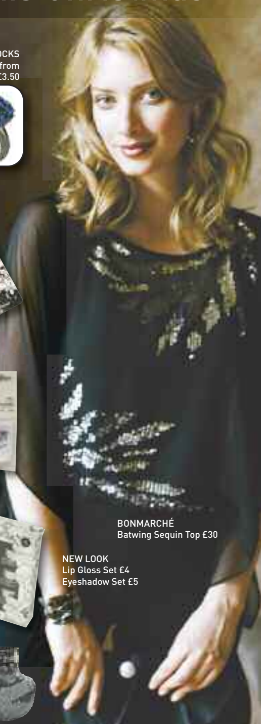
BONMARCHÉ Batwing Sequin Top £30