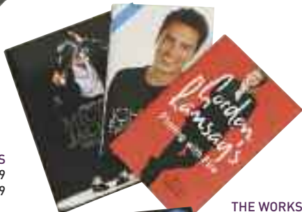
THE WORKS Annuals 3 for £10