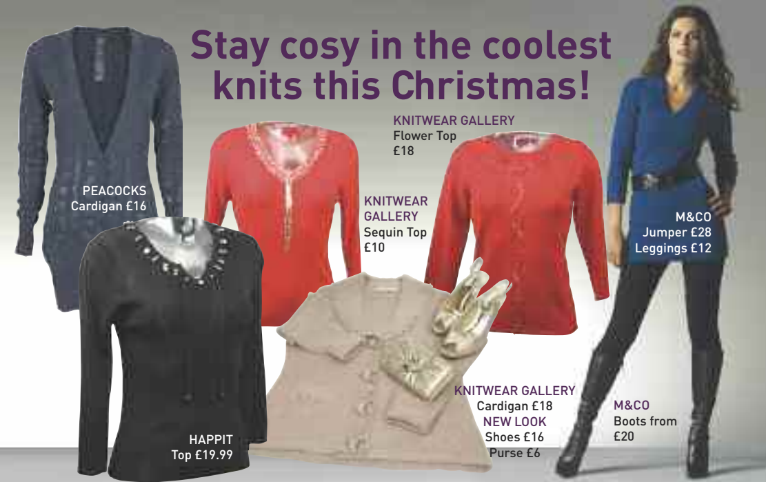
PEACOCKS Cardigan £16